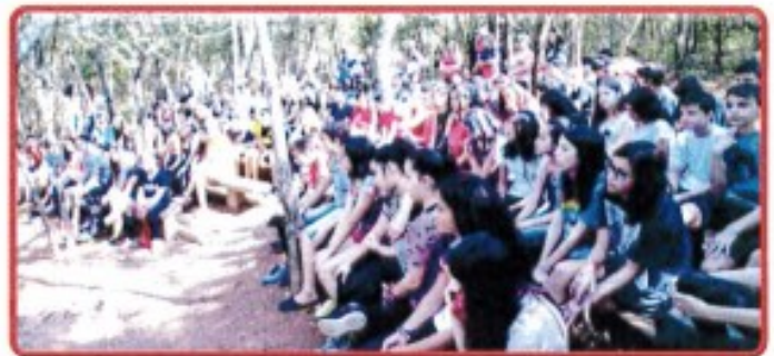
118 TEENAGERS FROM CATALAO DURING BIBLE STUDY IN OUR ADVENTURE RACE PROGRAM AT CAMP.

for them instead of what the world offers. She has helped with the many church retreats and school programs along with the everyday jobs of Camp Ministry.