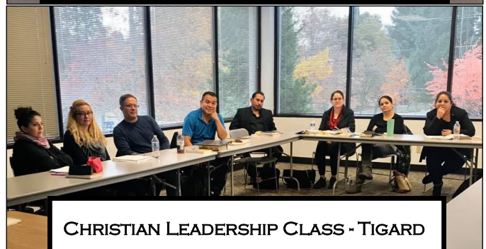
CHRISTIAN LEADERSHIP CLASS - TIGARD