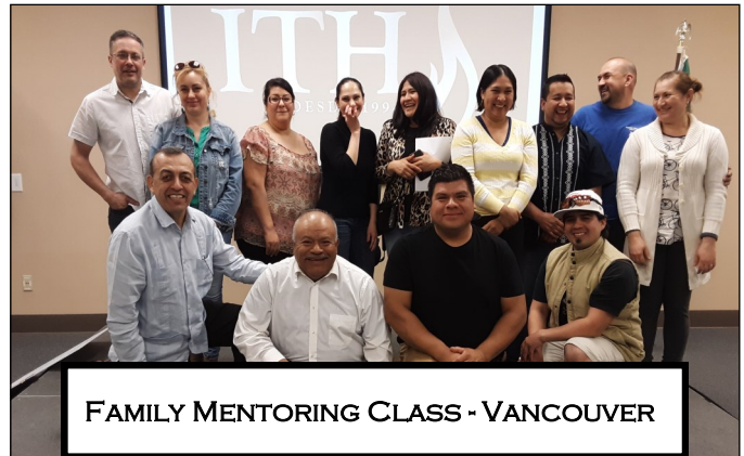
FAMILY MENTORING CLASS - VANCOUVER