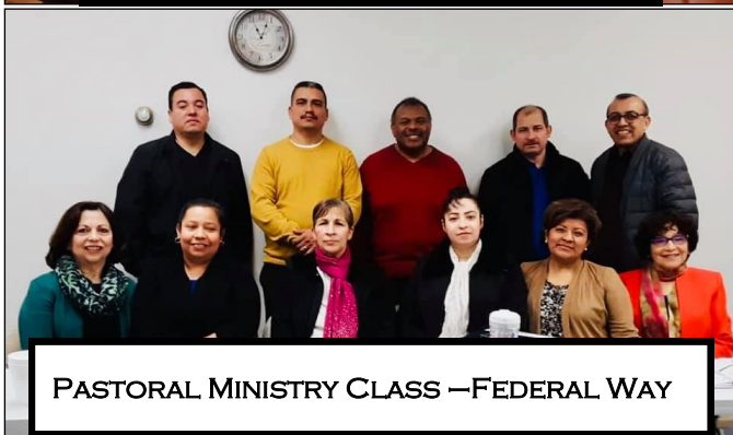
PASTORAL MINISTRY CLASS —FEDERAL WAY