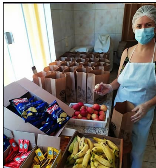
TELMA MQKINT LUNCH BAGS FOR PICNIC